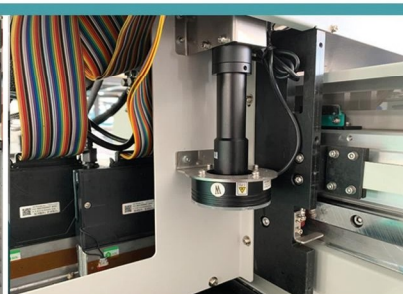
CCD Positioning System